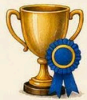
COMPETITIONS AND PRIZES