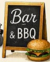
BAR & BBQ