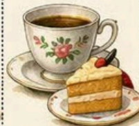
TEA & CAKE